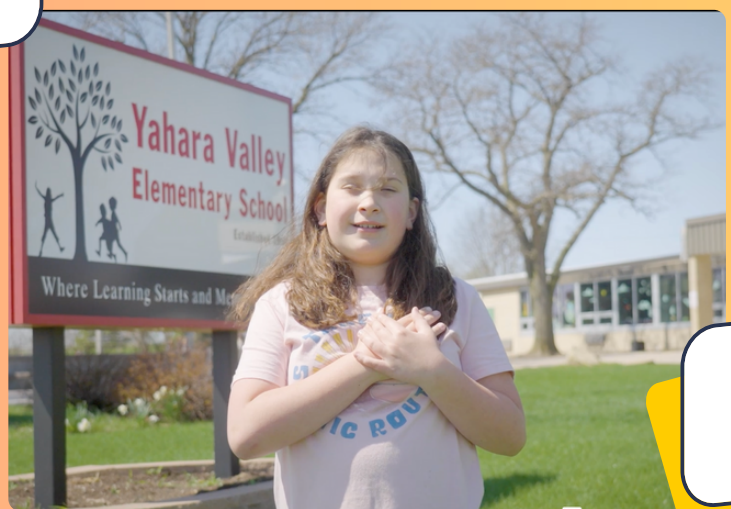
YAHARA, WI USA