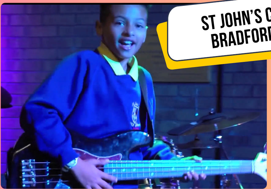
ST JOHN'S CE BRADFORD