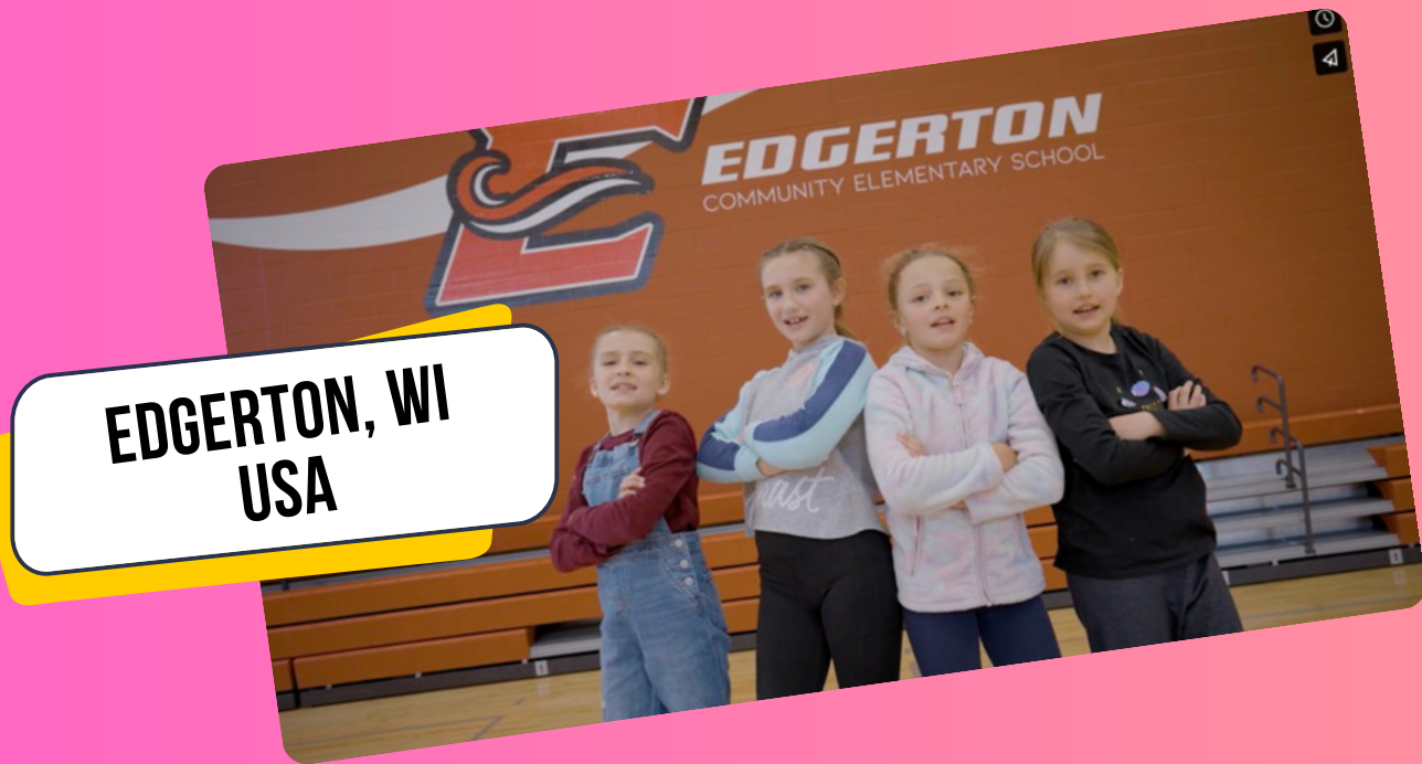
EDGERTON, WI USA