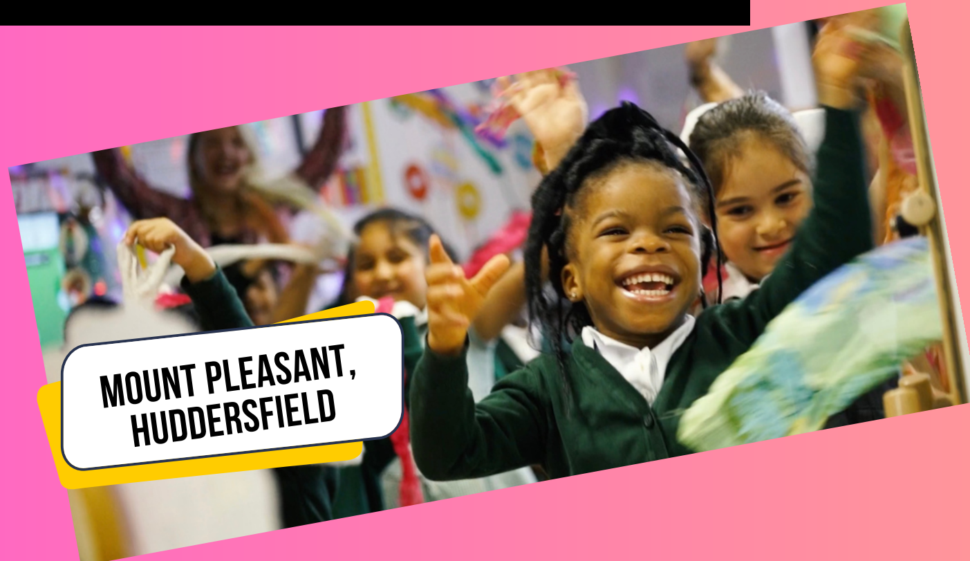
MOUNT PLEASANT, HUDDERSFIELD